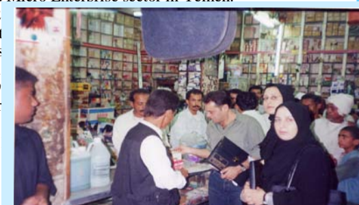
Syrian group during a field visits to one of the beneficiaries from Hodiedah MC Program

Although, according to the survey, the establishments suffer from high competition, market stagnation and weak infrastructure, 50% have plans for expansion. The study shows that small entrepreneurs need financial assistance, consultation in technology and production techniques.