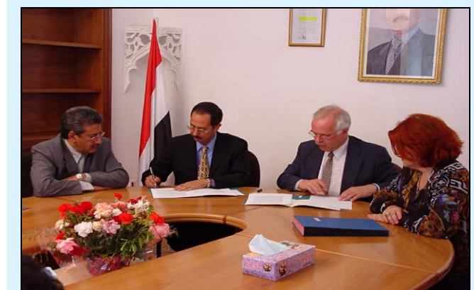
H.E. Ambassador of Netherlands and M.D. of SFD signing the agreement