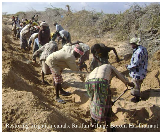
Restoring irrigation canals, Radfan Village-Borom-Hadhramaut

Finally, six refreshing courses were organized for 75 female literacy teachers in the integrated-intervention areas as well as two basic courses were conducted for 17 female literacy teachers (one in Outnah/ Haradh, Hajjah and the other in Al-Mashareej).