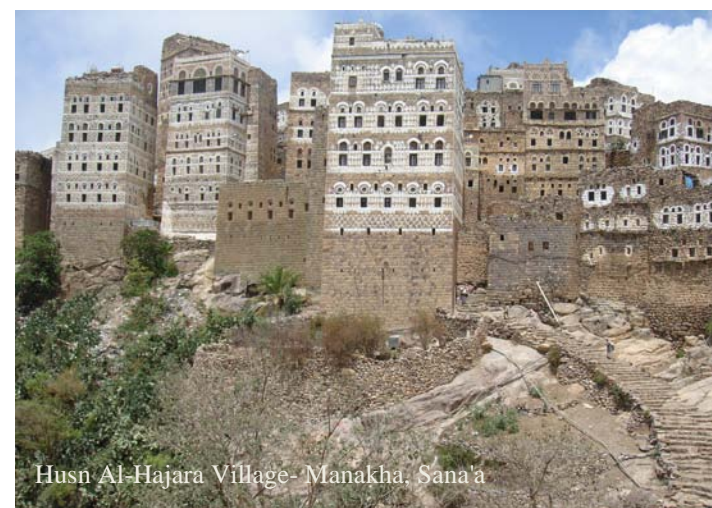
Husn Al-Hajara Village- Manakha, Sana'a

In addition, the third phase of restoring the decorated ceilings was launched focusing on the central and western parts of the northern aisles and targeting an area of 343 m 2 . Ceilings to be treated within this phase have the worst conditions and are the most damaged and corroded.