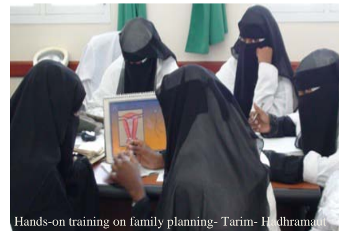
Hands-on training on family planning- Tarim- Hadhrmaut

Seeking stronger partnership with the Ministry of Health and Population and other partners, the SFD organized a three-day consultative workshop with UNICEF in Sana'a to exchange information and expertise to reach a better understanding of key programs and interventions that both institutions is planning in 2009 and to discuss coordination and cooperation possibilities on planning and implementing their activities. During the meeting, they revised the cooperation agreement on the mutual proposed project to enhance the system of training community midwives in the health institutions. The workshop ended with a mutual plan in the aforementioned sectors. Discussion was heated by all participants of both parties.