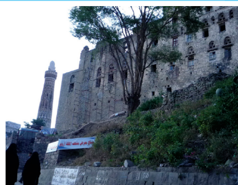
Repairing the 360-room Queen Arwa Palace Jibla-Ibb

The renovation team continued the repairing works on the minaret located at the eastern side. These efforts included works of supporting, walls injection and removal of the disintegrated and eroded stones and were rebuilt using the same old component specifications. The team is about to complete repairing all bases and walls of the downstairs rooms affected by the erosion of stone by salt and moisture. They also implemented supporting work to the cracked ceilings.