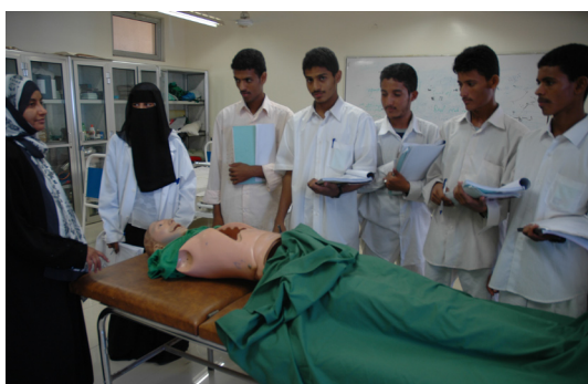
Various interventions in Nashir Medical Institute - Aden

The program aims at increasing birth cases under medical care and reducing mothers, neonatal and child mortality. The program developed a project to train 20 community midwives on door-to-door care for the mothers and neonatal health from several districts of Taiz governorate. It developed 7 projects to repair, equip and furnish the comprehensive obstetric emergency sections of the Al-Jumhuri Hospital - the Capital City of Sana'a, Al-Mukalla Hospital - Hadhramaout, and Haradh Hospital - Hajjah.