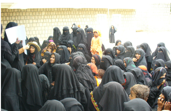
Alicting women representitive in Rural Prduction Group - Al-Khobit - Al-Mahwit