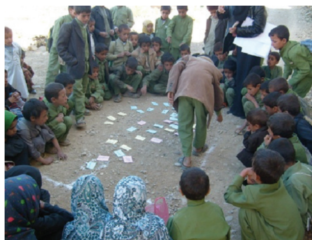
Anti-open defecation awareness activities

On its part, the Water and Environment Unit, during this quarter, prepared the updated Environmental Management Plan for the SFD Phase IV (2011-2015), and a relevant summary in Arabic and English on the website of the SFD.