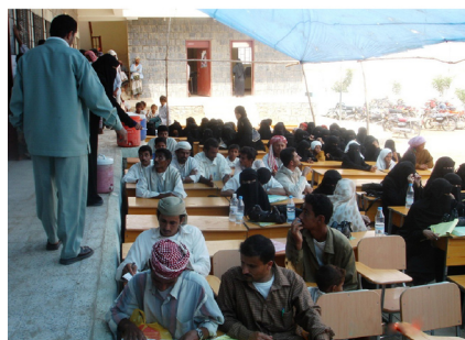
Empowerment of local communities, Alluhaia - Al-Hudaidah

Interventions included four projects, targeting the training of “consultant - field teams” in institutional development studies for al- Mukalla branch, training engineer –consultants “in skills of dealing with local communities for Ibb branch, and training 500 bee-keepers in al-Oudain branch district, Ibb governorate, as well as training about 1079 bee-keepers in 10 sub districts of Al-Haima Al-Dakhilia district, Sana'a governorate.