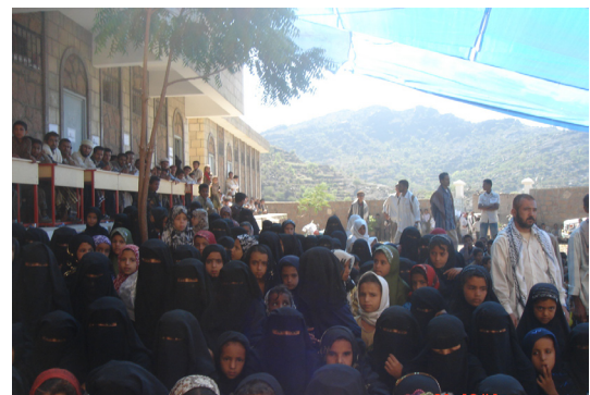
Awarenes activity on girls education - Asawedah - Taiz