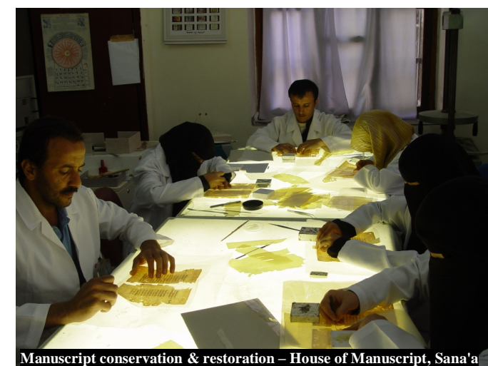
Manuscript conservation & restoration – House of Manuscript, Sana'a

Within the framework of continuous support of SFD for Dar Al-Makhtootaat (House of Manuscripts), electronic documentation and indexing of 1,152 manuscripts in Sana'a with photographs and descriptions of the content for each manuscript had been carried out by SFD. Materials for manuscripts conservation and restoration had been specially imported from Germany at a total cost of €64,000 for distribution to both the House and the Library of Manuscripts in Sana'a and Al-Ahqaf Library in Tarim (Hadhramaut).