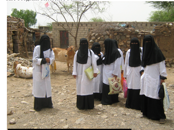
Community midwives trainers in several governorates

During the quarter, a training project was developed for community midwives' trainers in several governorates (Taiz, Hadramaut, Dhamar, Al-Baidha, Ibb) on the community care program and midwives trainers' curriculum (one-year system) was prepared as well as the practical skills manual was reviewed with the health institutes and the final revision of the SFD-developed Community-care Program Reference Manual.