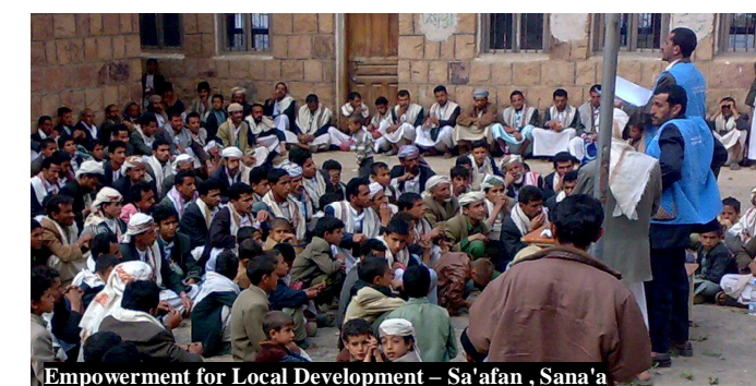
Empowerment for Local Development – Sa'afan, Sana'a

The third project provides support for the establishment of a public library in the town of Al-Baidha', to be managed by Al-Baidha' governorate Culture Office. Components of support included equipment, books and training for the library staff (2 persons) in indexing and documentation.