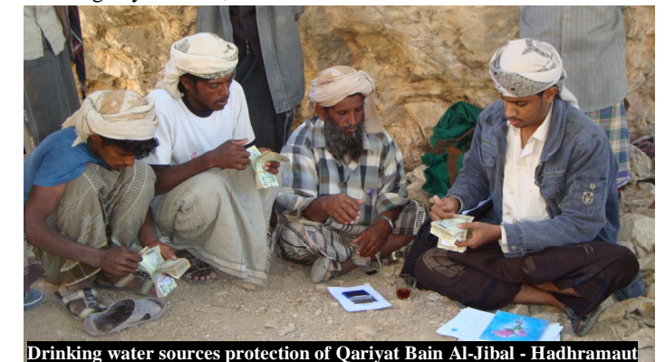
Drinking water sources protection of Qariyat Bain Al-Jibal - Hadhramaut

Under this phase, 40 EU- and UK-funded projects were approved worth nearly $5 million. These projects are distributed over six food-related sub-sectors of integrated intervention, roads, rainwater harvesting, terraces rehabilitation, agricultural land protection and reclamation and preliminary studies. About 44,000 people benefit directly from these projects, which will create more than 470 thousand working days. This brings the cumulative number of projects of phase II to 168 projects at a total estimated cost exceeding $20 million and the number of beneficiaries to about 280,000 people, with job opportunities of 2.1 million working days created, of which 17% for women.