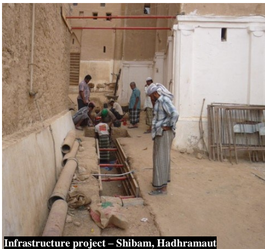
Infrastructure project – Shibam, Hadhramaut

As for the infrastructure project of the city of Shibam (Hadhramaut), the Unit Head paid a visit to the project in December 2010, whereby he met with Hadhramaut Deputy Governor. During the meeting, the two parties discussed and approved the 2011 Project Plan and agreed to visit the project every three months to assess the implementation progress.