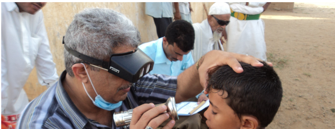
DIAGNOSIS OF LOW VISION AND BLINDNESS IN AL-KHAZNAH VILLAGE - ABS - HAJJAH

integrated food intervention, as well as the conditional cash transfers to be financed by the World Bank and implemented by the SFD in partnership with the MoPHP. The SFD representatives also participated in the consultative and planning workshop to enhance outcomes and accountability in the aspect of mothers and children health. The SFD completed plans of its component related to the Reproductive Health and Population Program (RHPP2) which targets governorates of Al-Mahwit, Hajjah, and Al-Baidha in coordination with the RHPP offices and health offices in the relevant governorates.