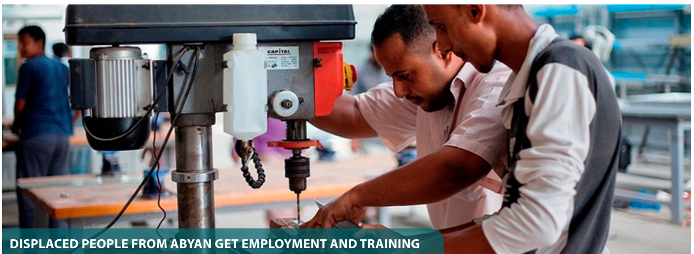
DISPLACED PEOPLE FROM ABYAN GET EMPLOYMENT AND TRAINING

The Network carried out during the period from October until December, 2012, six on-the-job training courses, which targeted 111 participants from YMN's participant institutions. The courses focused on raising the skills of the participants in management, market research, and feasibility studies, training of trainers, customer service, auditing, and evaluation.