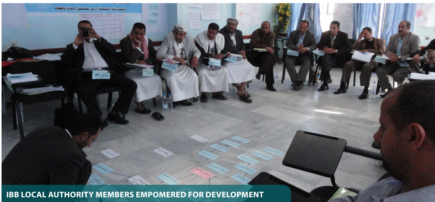
IBB LOCAL AUTHORITY MEMBERS EMPOWERED FOR DEVELOPMENT

Main activities included training 25 trainers (including 10 females) from among RAWFD outputs. About 438 persons from the Program's outputs from 7 governorates were also communicated for the purpose of evaluating the extent of the benefit they had gained after attending the Program's training courses. Promotional information about 20 Program graduates was also provided to some development agencies working in the country together with database details concerning them. That was for the purpose of allowing these agencies to make use of their efforts and know-how. About 30 self-help initiatives by youth were also followed up. These initiatives had been implemented in a number of districts in Hadramout, Ta'iz, Hajja, and Ibb. This is in addition to initiating targeting through drawing up a list of about 300 new advocates (male/female) from the governorates of Lahj, Abyan, and Dhale'e. The electronic website www.rawfd-sfd.com was also launched