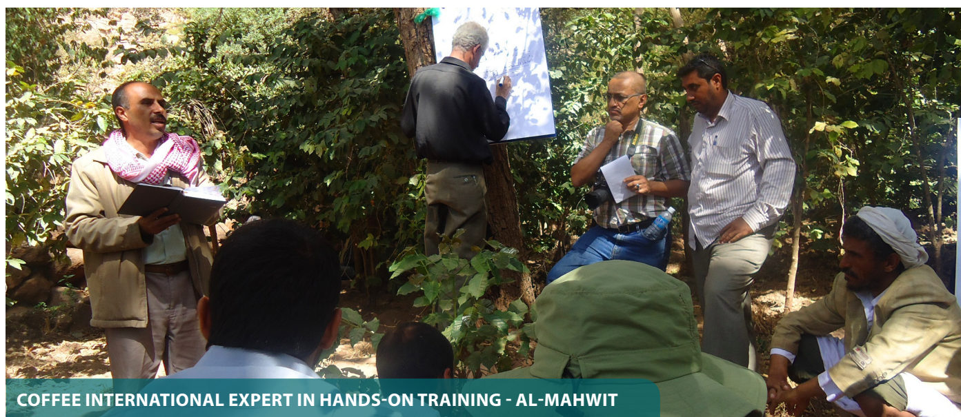
COFFEE INTERNATIONAL EXPERT IN HANDS-ON TRAINING - AL-MAHWIT