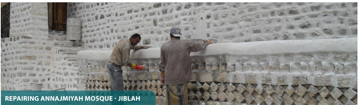
REPAIRING ANNAJMIYAH MOSQUE - JIBLAH

The works at the project for strengthen and supporting five palaces in the historic city of Tarim have been fully completed, where interventions included consolidation works and repairing the structural cracks and make some necessary restoration works and removing the dangers that threaten the structures in order to save those palaces from collapse.