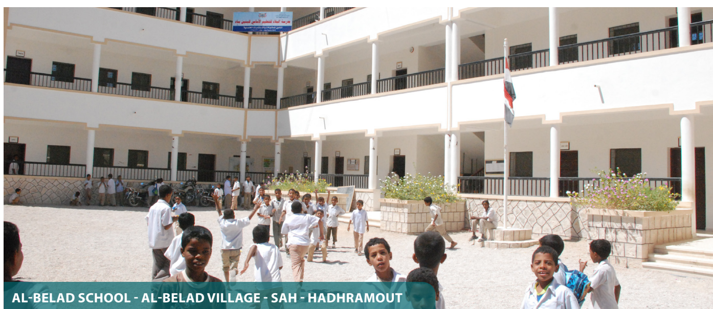
AL-BELAD SCHOOL - AL-BELAD VILLAGE - SAH - HADHRAMOUT

training courses were carried out in first aid and prevention of contagious diseases, targeting 46 female literacy teachers and secondary students of Aisha Center for Women Education and Training in Bani Hushaish District (Sana'a). Moreover, two 6-day hygienic and environmental campaigns were implemented in two sub-districts of Bani Hushaish and attended by 119 female participants, covering topics such as healthcare, prevention of infectious diseases, malnutrition, hygiene and cleanliness as well as proper disposal of household wastes and converting them to fertilizers. Finally, the tender was announced and awarded for completing the construction works of the Early Childhood Development Center in Al-Thawrah District (Capital City).